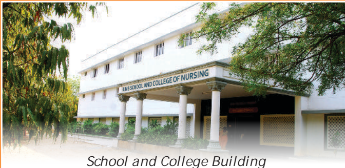
School and College Building