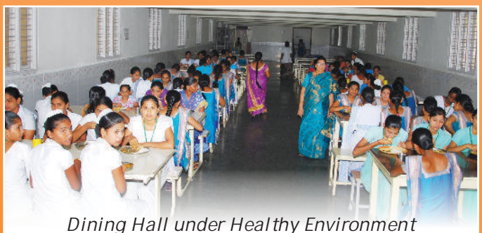
Dining Hall under Healthy Environment