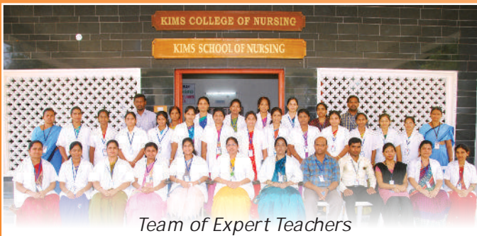
Team of Expert Teachers