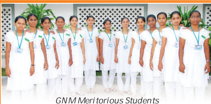
GNM Meritorious Students