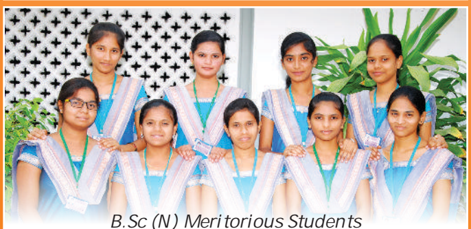
B.Sc (N) Meritorious Students