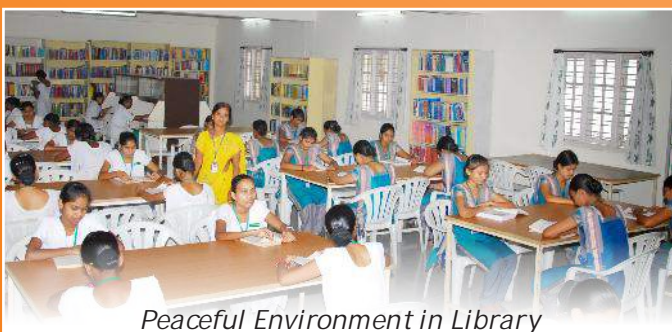
Peaceful Environment in Library