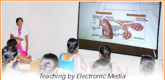
Teaching by Electronic Media